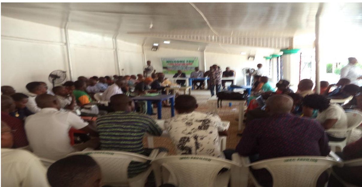
Cross section of participants at the dialogue session with INEC