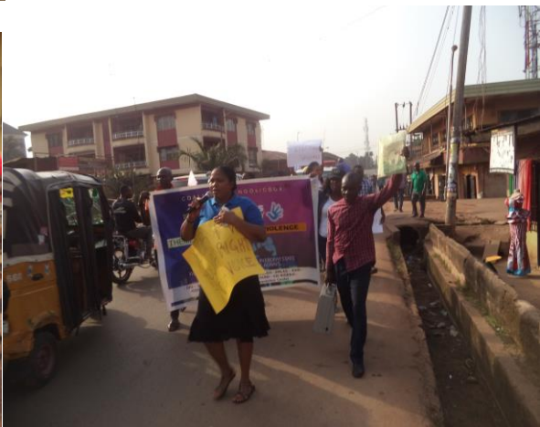
George talking to the press after the rally