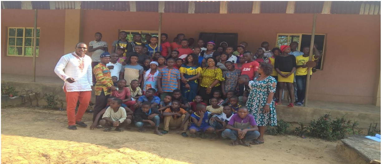
After the sensitization workshop with youths of Christ Apostolic Church, Isielu.