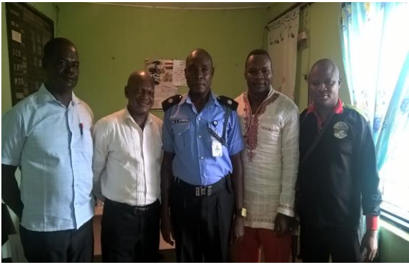
Visiting the Local Government Chairman and the DPO of Onueke, One of the most politically violent towns in Ebonyi State