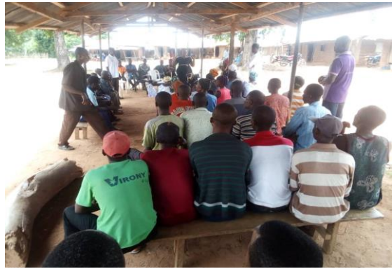
inaugurating the Onuayim branch

We have inaugurated two new branches in the later part of the year – Ezza South and Onuayim, whilst four others are in line for both training and inauguration. It is fascinating to note that requests for HRCRC branches come from