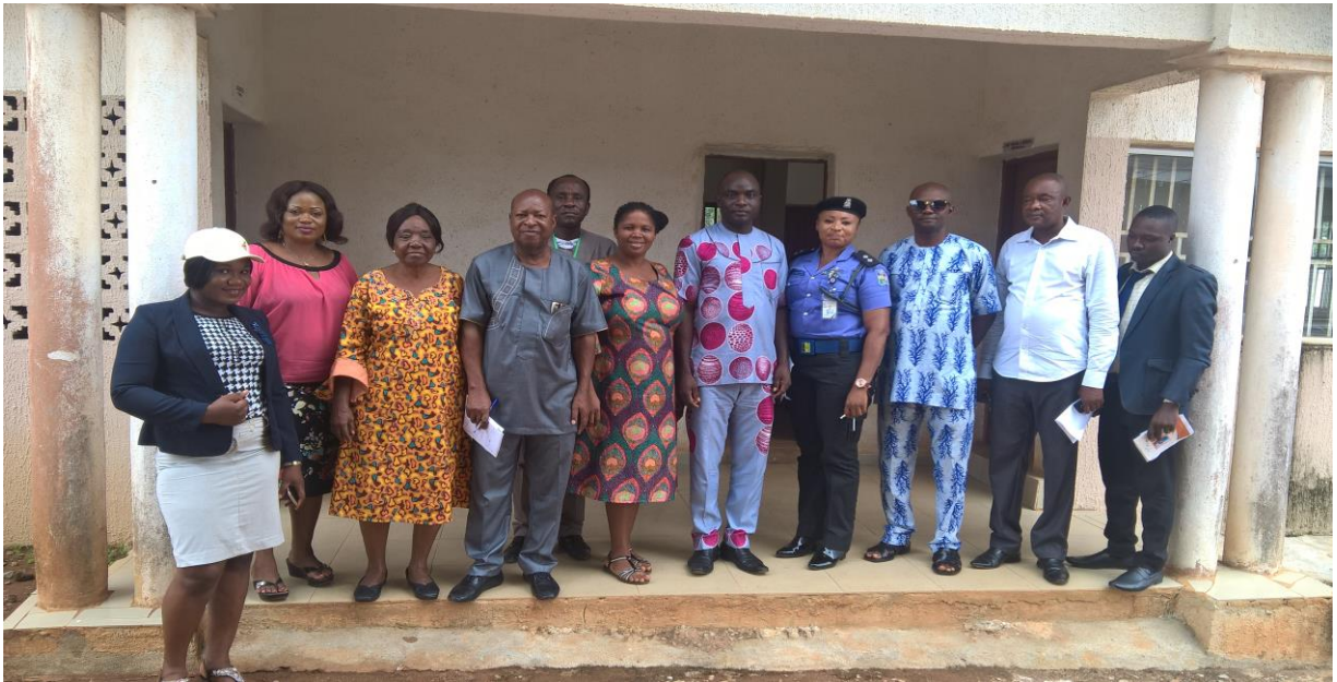
Stakeholders after the launch of the Election without Tension forum in INEC office, Abakaliki